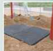
Swing Seats, Parts & Swing Mats