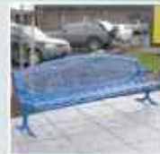
Benches & Plaques (custom color available)