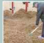
Safety Surfacing & Containment Curbs