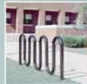
Bike Racks & Bike Storage