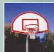
Outdoor Basketball, Tennis, Soccer