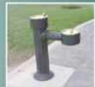
Drinking Fountains & Replacement Parts